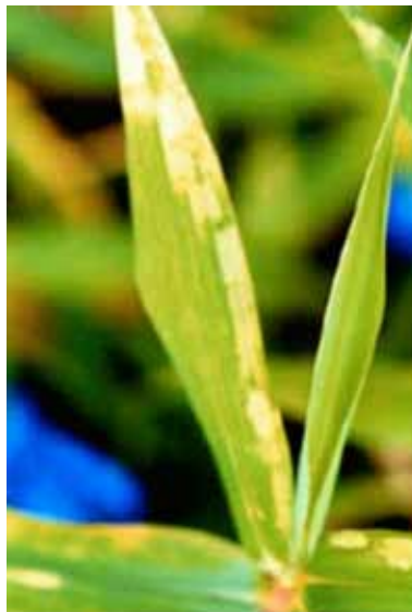
Mite injury on bamboo leaf