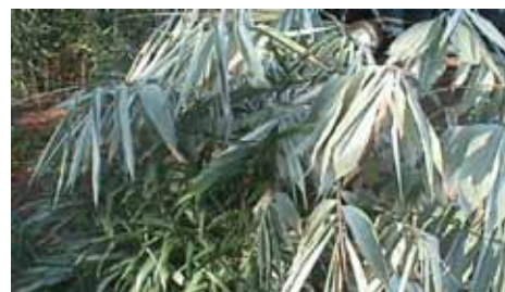
Typical cold injury symptoms on bamboo: dry, silvery-type color.