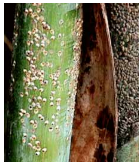
Scale on bamboo