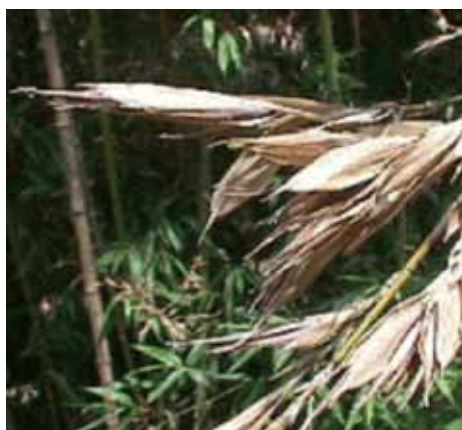
Bamboo flowers (seeds have been spent)