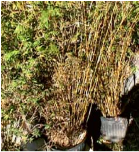
Bambusa multiplex Tiny Fern