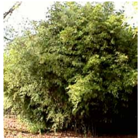
Sasa veitchii Kuma-Zasa