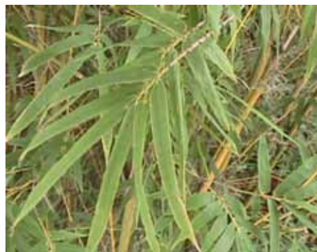
Bambusa multiplex Riviereorum