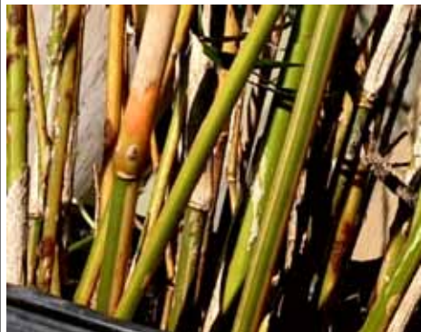
Bambusa multiplex Fernleaf Stripestem