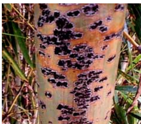
Fungus on bamboo