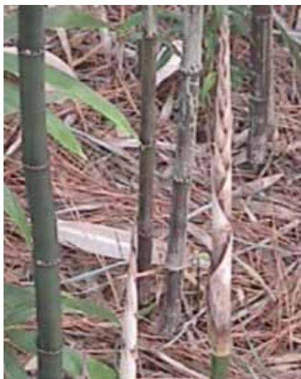
Cane or Culm (left) on new shoot (middle), and week-old shoot (right)