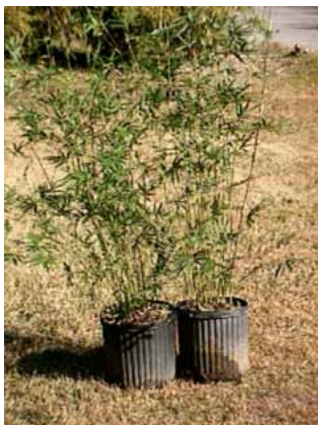
Bambusa multiplex Fernleaf