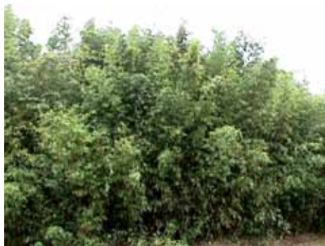
Phyllostachys rubromarginata Red Margin Bamboo