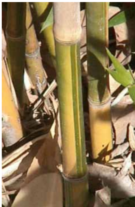
Bambusa dolichomerithalla Green Stripestem