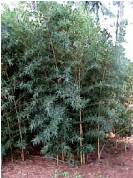
Phyllostachys aurea holochrysa Golden Golden