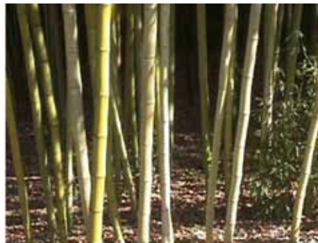
Phyllostachys vivax Vivers Bamboo