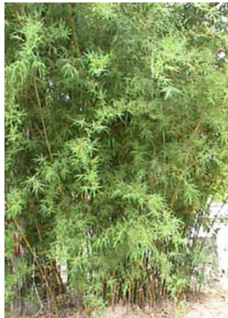
Bambusa multiplex Silverstripe