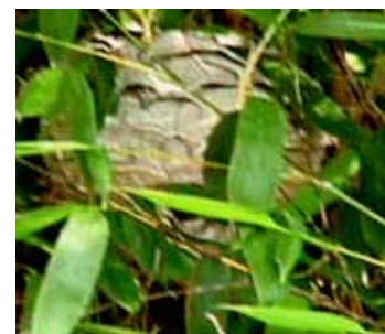
Paper wasp nest