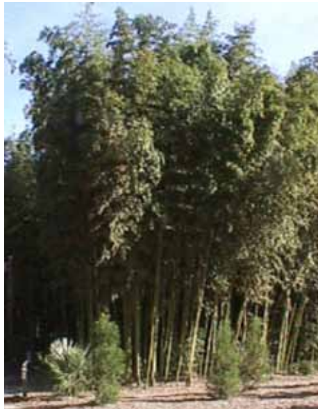
Phyllostachys bambusoides Giant Japanese Timber Bamboo Madake