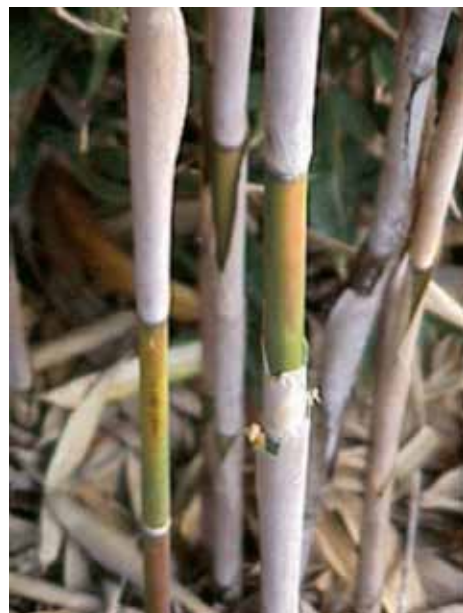
Sinobambusa tootsik albostrata